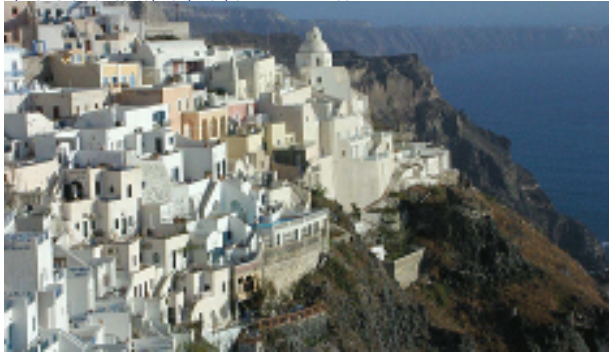
Carved out by a volcanic eruption, Santorini offers stunning views galore