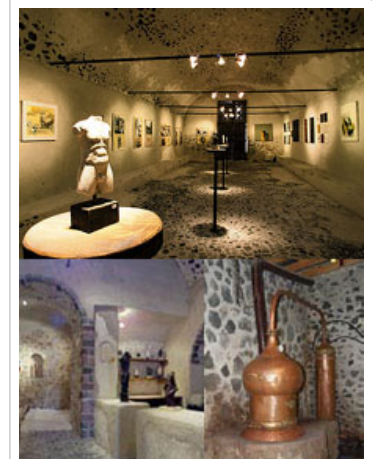
ART SPACE ARGYROS CANAVA - EXO GONIA