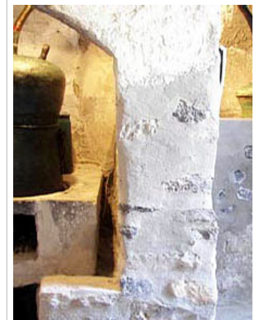
ART SPACE ARGYROS CANAVA - EXO GONIA

There are buses leaving for Kamari from Fira the capital via Messaria village. You will find the exhibition on the road to Kamari on the right hand side. Look for the signpost. (Alternatively, if you are staying in Kamari, the return bus to Fira will also drop you off. Ask for Exo Gonia bus stop)